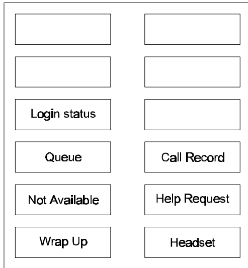
Figure 1 Possible ACD Button arrangement - Speakerphone Set