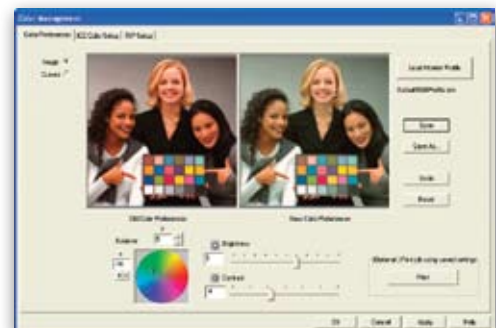
Color Editing generates exceptional print output

MicroPress offers TrueCurves for universal curve creation, making the process quick and easy with mouse-drag functionality and anchor points for sophisticated fine-tuning. It also offers multiple proofing emulations per printer, allowing a single engine to produce various proofing emulations by selecting printer queues with different color setups.