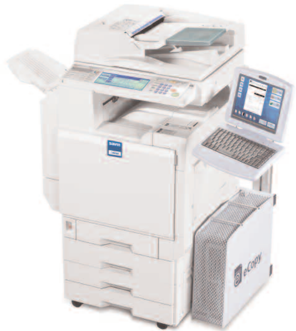
The ergonomic design includes a height-adjustable color touch-screen panel and keyboard, supporting 508A Disabilities Act Compliance.