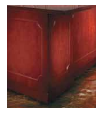
Traditional picture-frame molding available, allowing you to tailor Legacy to your taste. Specify DX models for molding.