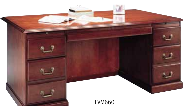
66W x 30D x 30H Double Pedestal Desk