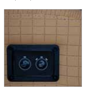
Heat & Massage Operated through pushbutton control located on

inside of arm (not available on pillow back models).