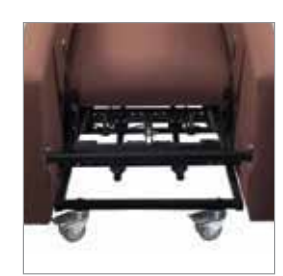
High-Carbon Steel Frame Delrin bushings at critical