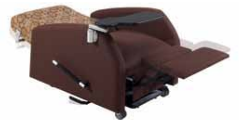
Trendelenburg Tilt Feature

Offers a negative 3 degree pitch from the full flatbed position*