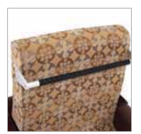
Brushed Aluminum or Black Powder Coated Push Bar Optional black or brushed aluminum push bar with black textured grip.

• Clear vinyl headrest covers for non-pillow back models