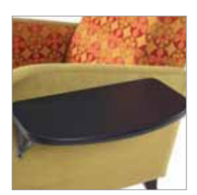
Folding Side Table

Black polyurethane or wood arm caps (available in 11 standard finishes.)