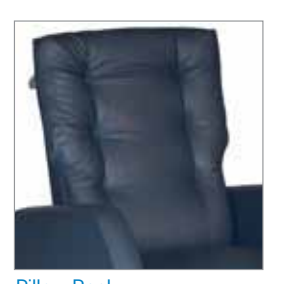
Pillow Back Tufted look pillow back on 834, 835, 836 and 837.

3" non marking dual wheel swivel casters. Pressed steel housing with double ball bearing swivel head. Locking rear casters.