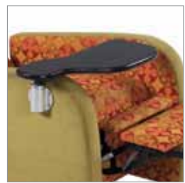
Tablet Arms Select from two optional tablet arms.

Optional brushed aluminum foot rest lever with black textured grip to replace standard black lever. Hands free foot pedal to activate Trendelenburg feature.