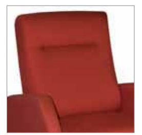
Bariatric Widths 28.5" inside clearance rated at 750 lb. capacity.

Optional side table locks solidly in place yet easily folds flat. Shown on Haley Recliner 840.