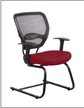
759G Guest Chair Breathable Fabric Seat