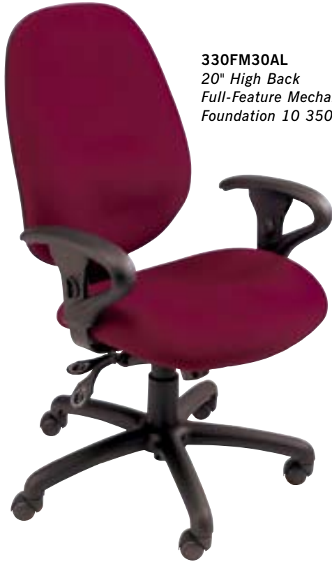
330FM30AL 20" High Back Full-Feature Mechanism Foundation 10 350-001 Wine