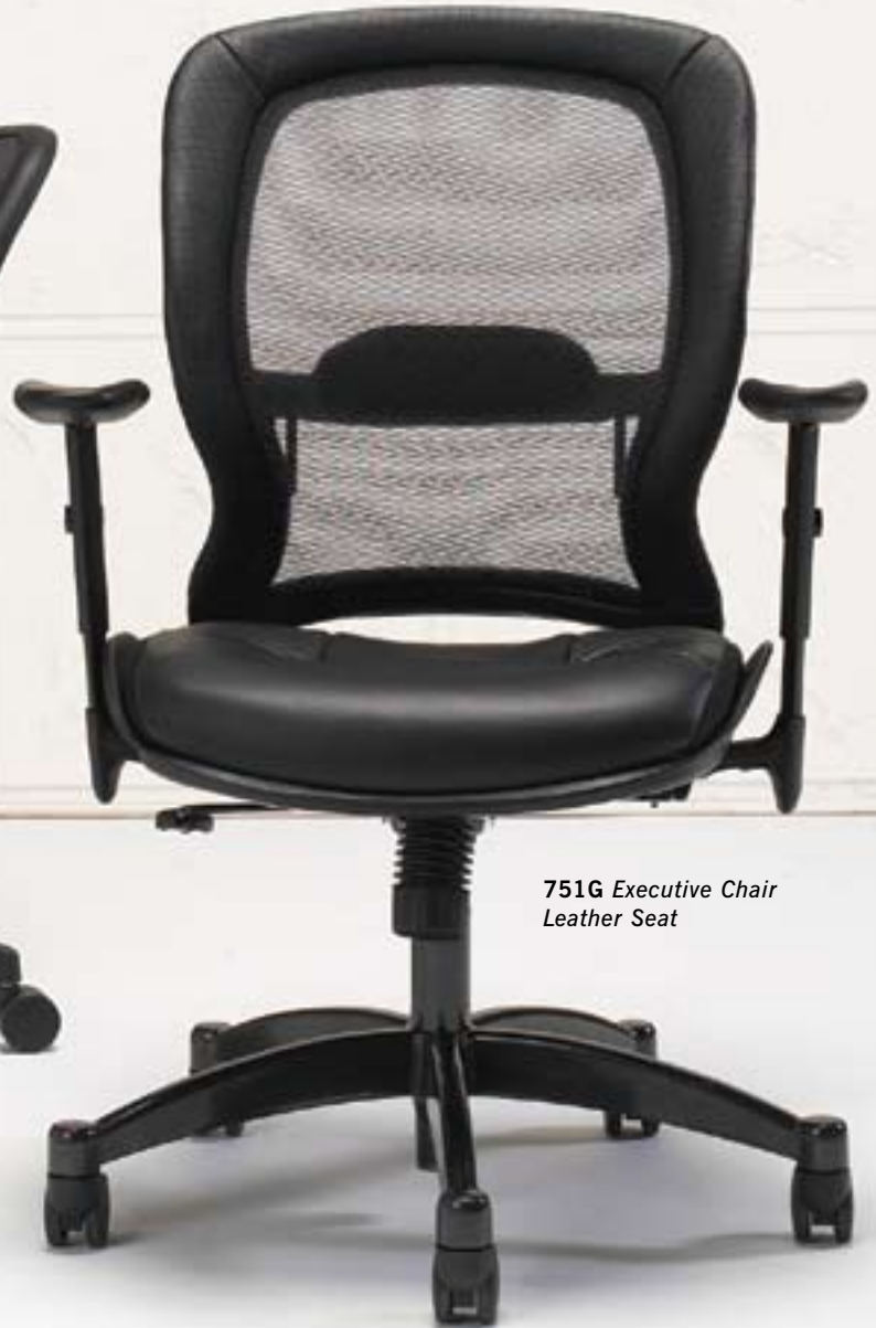
751G Executive Chair Leather Seat