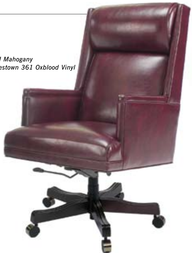
181 MAH Mahogany Jamestown 361 Oxblood Vinyl