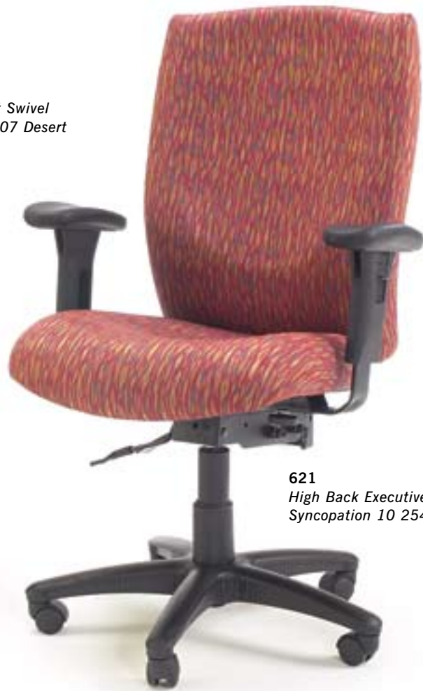
621 High Back Executive Swivel Syncopation 10 254-001 Chili