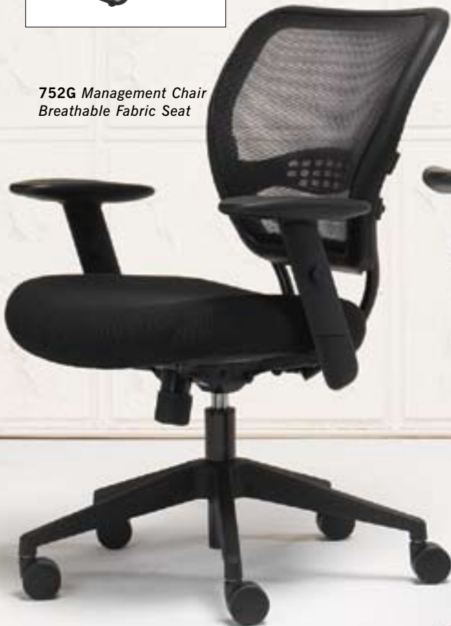
752G Management Chair Breathable Fabric Seat