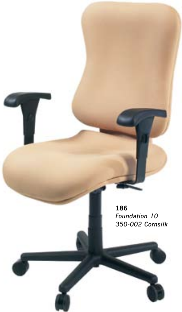
186 Foundation 10 350-002 Cornsilk