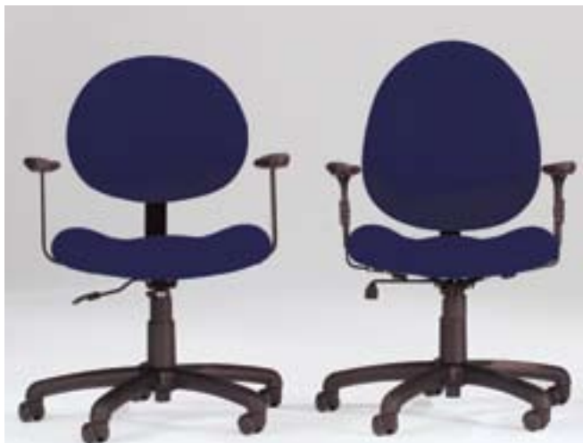
320BM30T Mid Back Task Cobblestone 670 Navy

Height and width-adjustable Loop Arms feature forward-slope and wide surface area for optimum comfort and support.