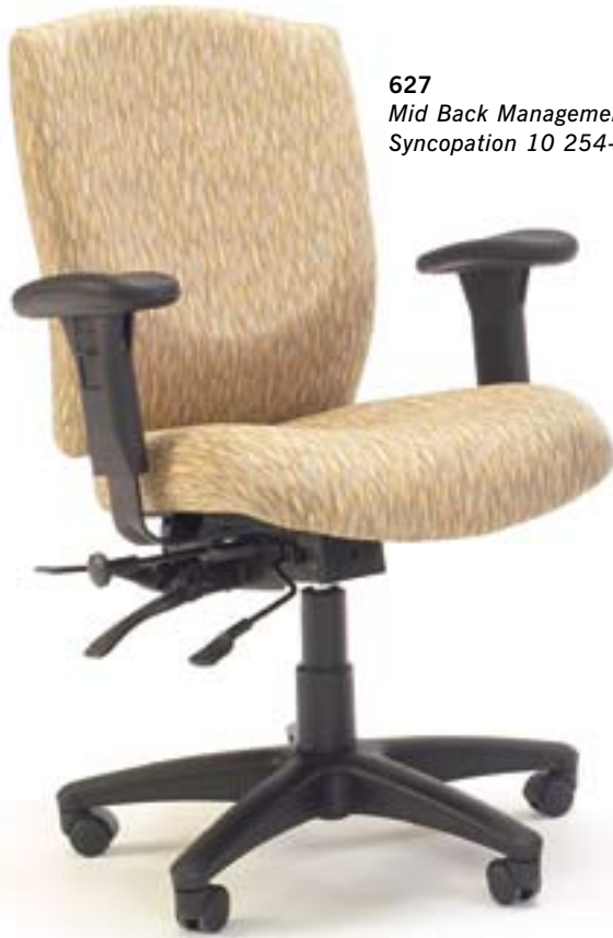
627 Mid Back Management Swivel Syncopation 10 254-007 Desert