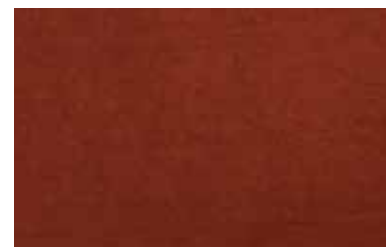
WC Windsor Cherry