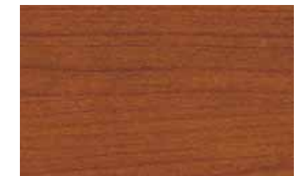
CCY Classic Cherry