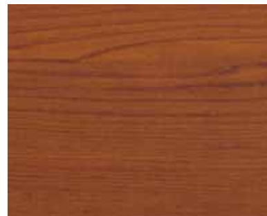
CC Classic Cherry