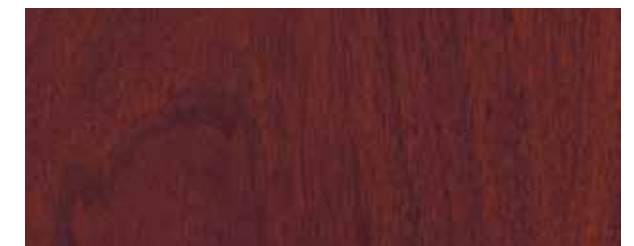
RM Rouge Mahogany