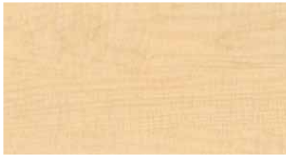
FM Natural Maple