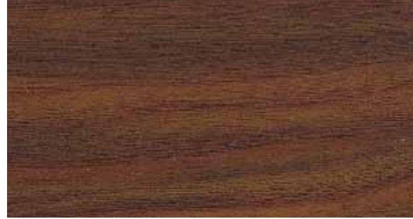
W Gunstock Walnut