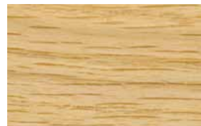
NOK Natural Oak