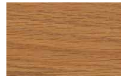
OAK Medium Oak