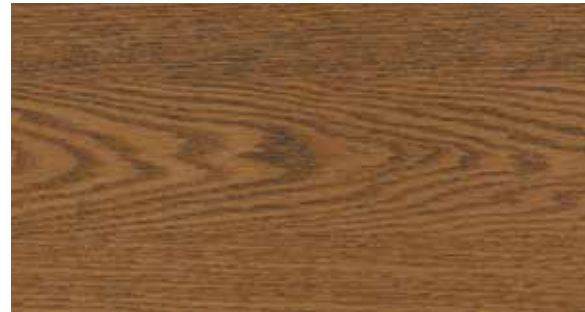
O Medium Oak