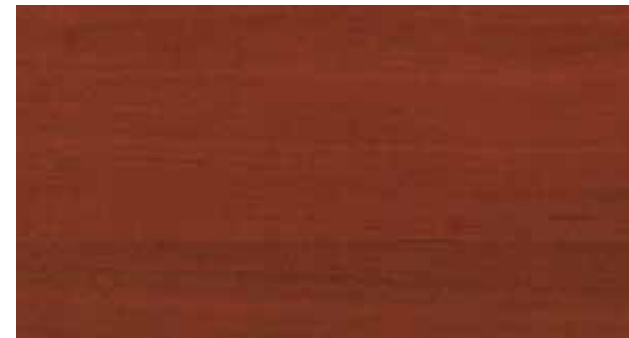
WC Windsor Cherry