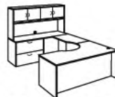
72" X 108" Executive U Unit w/ Curved Corner Desk