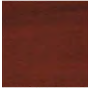
WC Windsor Cherry