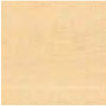
FM Natural Maple