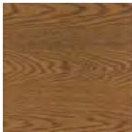
O Medium Oak