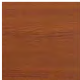
CC Classic Cherry