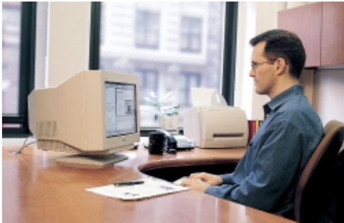
With a CRT, the user has no usable work space in front of him, forcing him to turn to the right and left to answer the phone, read, write, and perform other normal office tasks.