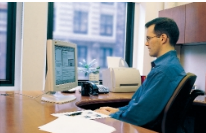
A flat panel monitor, without an adjustable arm, only frees up space behind the computer monitor and does not result in any additional usable work space.