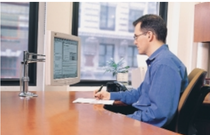
With the addition of a flat panel monitor arm, space is opened directly underneath the monitor and the monitor can easily be pushed back when the user needs full access to his work surface.

However, most experts agree that flat panel monitors, implemented correctly, can significantly reduce an organization's overall costs.