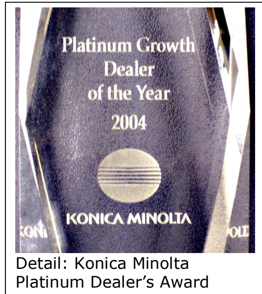
Detail: Konica Minolta Platinum Dealer's Award