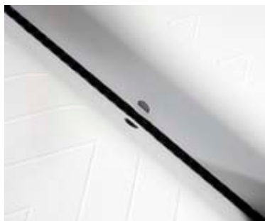
9 1/2" feed opening easily accommodates letter and legal size paper.