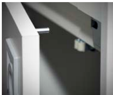
Safety features include automatically shutting off the shredder when the door is open.

Proficiency best describes Dahle's line of Small Office Shredders with their ability to get the job done quickly and easily with minimal effort. Small offices or teams of employees will benefit from the ease of use and quiet operation of these small to mid-size shredders. They're designed to shred between 100 and 400 sheets of paper per day and are perfect for destroying personnel records, client proposals and tax information.