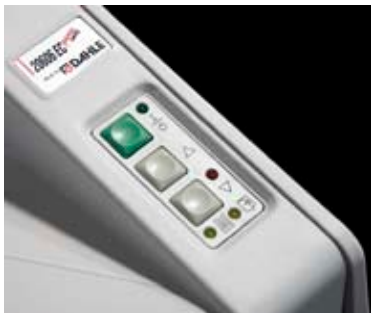
The electronic control panel allows for auto on/off, continuous run, and reverse operation