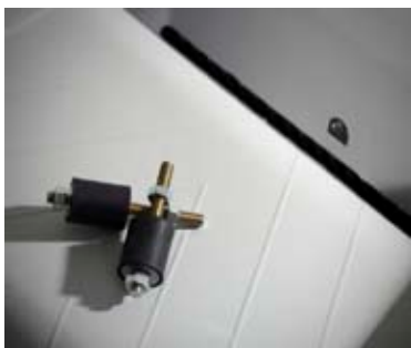
Rubber shock mounts reduce vibration and provide extremely quiet operation.

With the widespread use of networked printers and fax machines, confidential business information is constantly being printed throughout the workday. It's important to have a powerful shredder located nearby to easily dispose of this information. Dahle Office Shredders are designed to accommodate the needs of most busy offices by shredding between 400 and 2,000 sheets of paper per day. This is the perfect device for properly destroying marketing plans, health records, and any other confidential information that should not be seen by others.