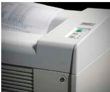
Dahle High Security shredders have been tested and approved by the NSA under NSA/CSS Specification 02-01.

In order to protect our National Security, military and government agencies require higher levels of security from their paper shredders. With this in mind, the U.S. Department of Defense has increased the requirements for the destruction of Top Secret COMSEC documents. NSA/CSS Specification 02-01 is the current standard for maximum particle area and maximum particle dimensions as well as setting a tough standard for machine durability.