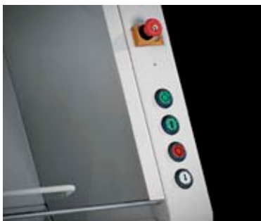
User friendly controls provide ease of use and reduce the chance of injury.

In today's society there's nothing more critical than the accumulation of large volumes of confidential waste. A company's financial records, health information or personnel records can be seen by all if not shredded immediately. Dahle High Capacity Shredders are just the tools to destroy large quantities of paper in a short amount of time. These machines fit nicely in company mail rooms or any other centralized location where large amounts of shredded material is taken. Expensive shredding services are no longer needed with the ability to hold 50 gallons of shredded confidential waste. Not to mention the confidence in knowing your documents are immediately destroyed and can no longer be seen by others.